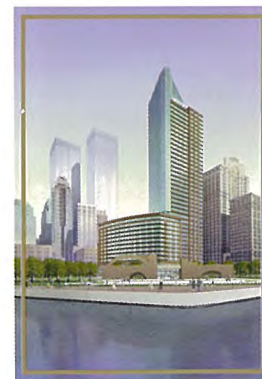
THE RESIDENCES AT THE RITZ-CARLTON, DOWNTOWN, NEW YORK

O ceanfront views and prime city locations. Twice daily housekeeping and room service in the privacy of one's own home. A unique real estate purchase coupled with the luxuries of five star hotel services. The Ritz-Carlton redefines the luxury lifestyle with the debut of The Residences. The urban and resort condominium Residences are under construction and available for purchase in Washington, D.C.; New York City; Sarasota, Coconut Grove and Key Biscayne, Florida; Boston, Massachusetts; and Grand Cayman, British Virgin Islands.