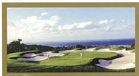
THE RITZ-CARLTON ROSE HALL, JAMAICA

R itz-Carlton Resorts opening during the next two years will debut 162 holes of golf in stunning locations. These new sites for golf enthusiasts will add to the combined 108 holes of golf at existing Ritz-Carlton Resorts.